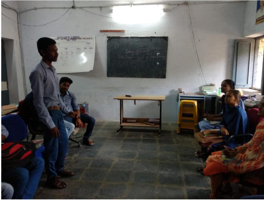
Student Seminars on Consumers day