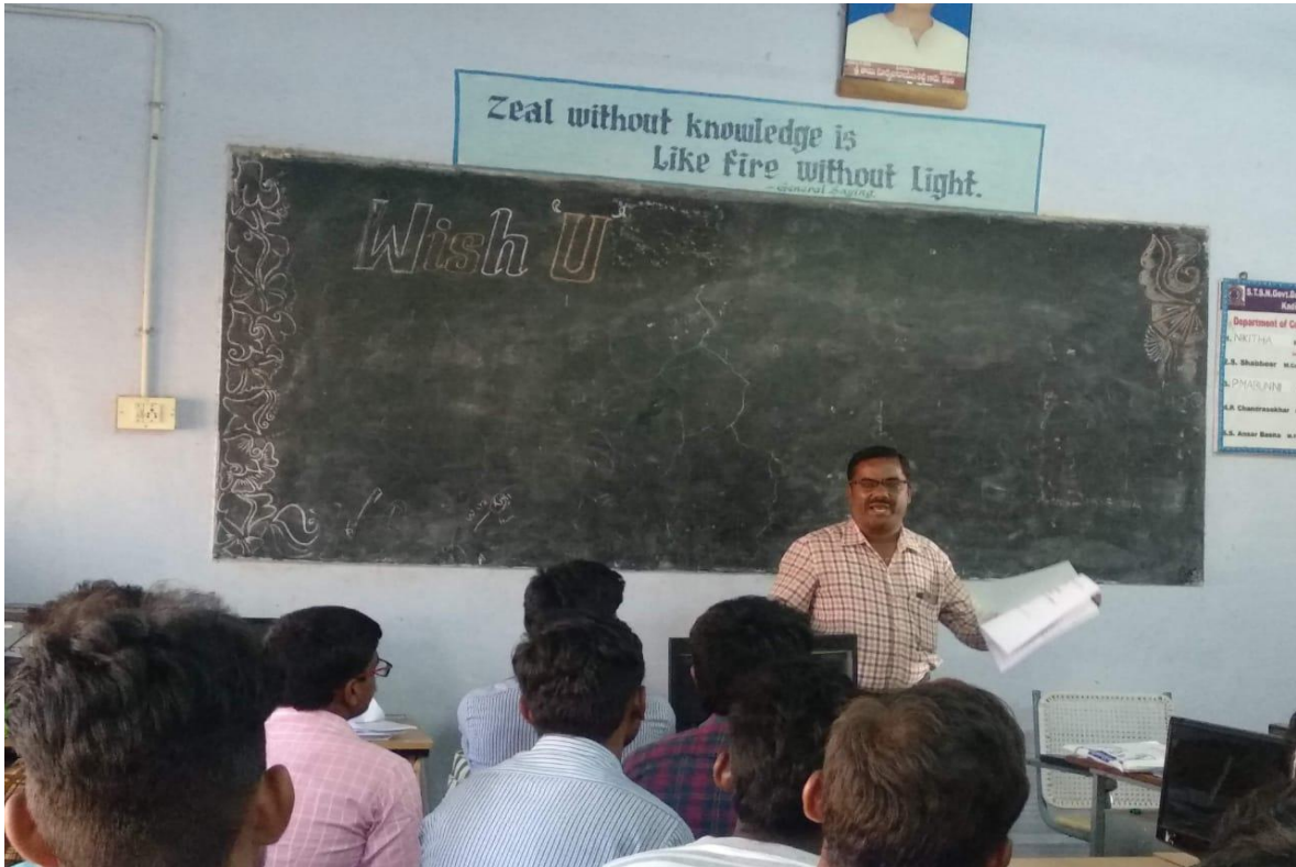
Group discussion by III B.Com on "Banking System in India"